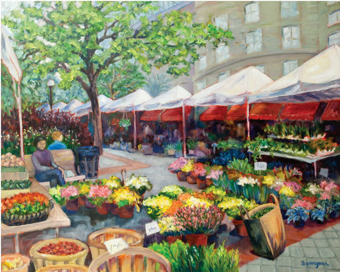
Waiting in Copley Square