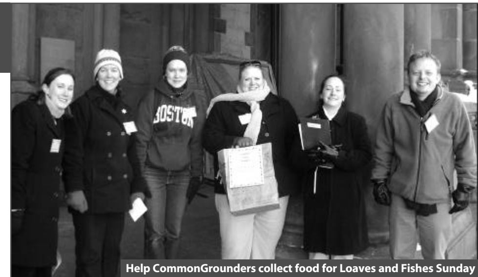
Help CommonGrounders collect food for Loaves and Fishes Sunday