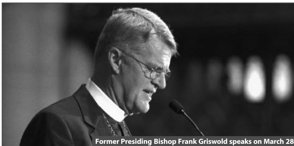
Former Presiding Bishop Frank Griswold speaks on March 28

For more info, see this month's Trinity Newsletter , or www.trinitychurchboston.org