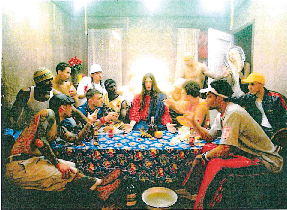
Contemporary Last Supper – Photographer: David La Chapelle