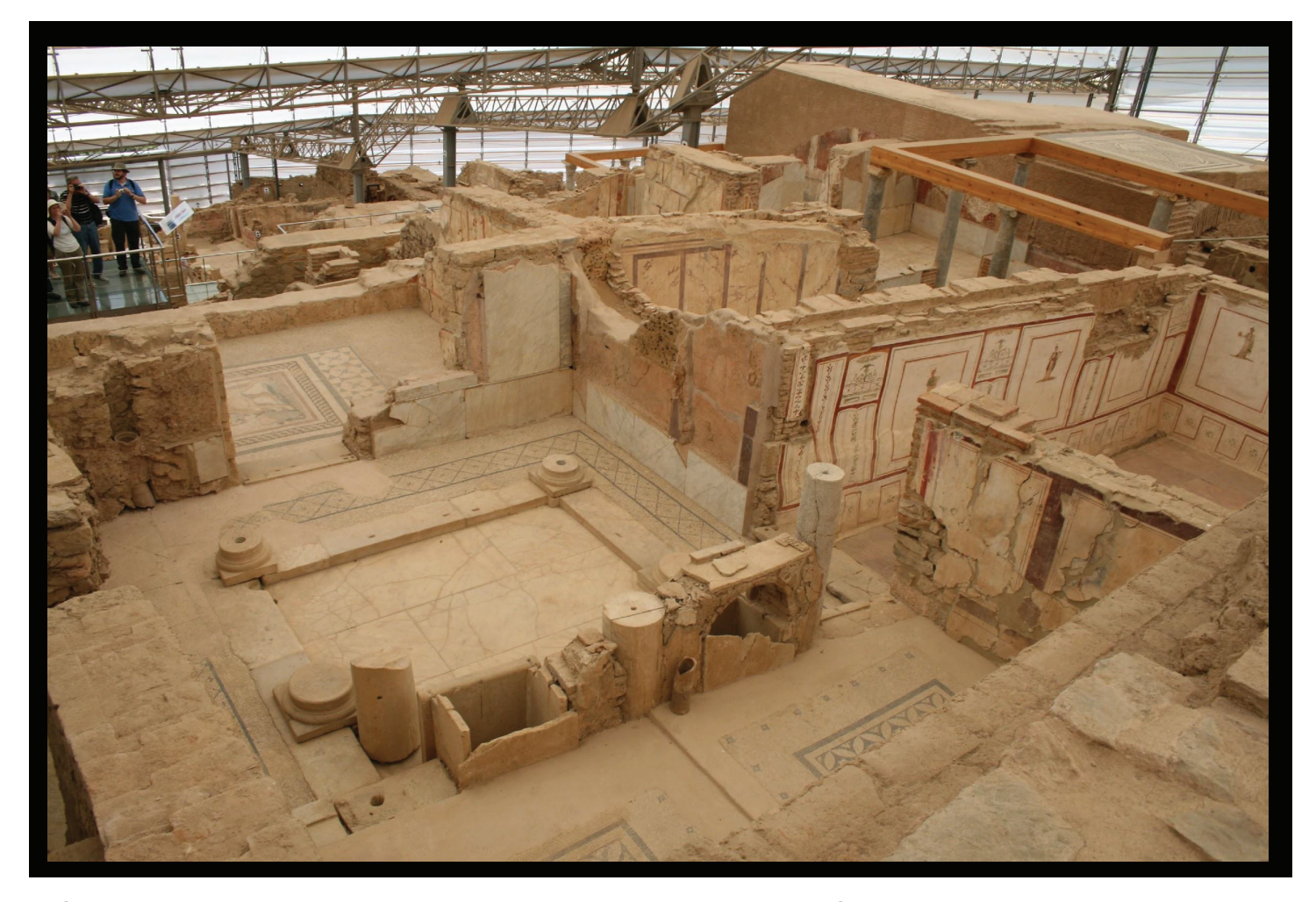
Ephesos, Terrace House 2, Apartment 3, overview. Facing northeast.