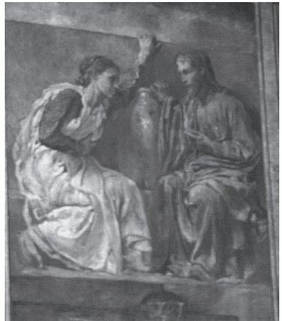
Christ and the Samaritan woman at the well; Trinity file photo, 2008.