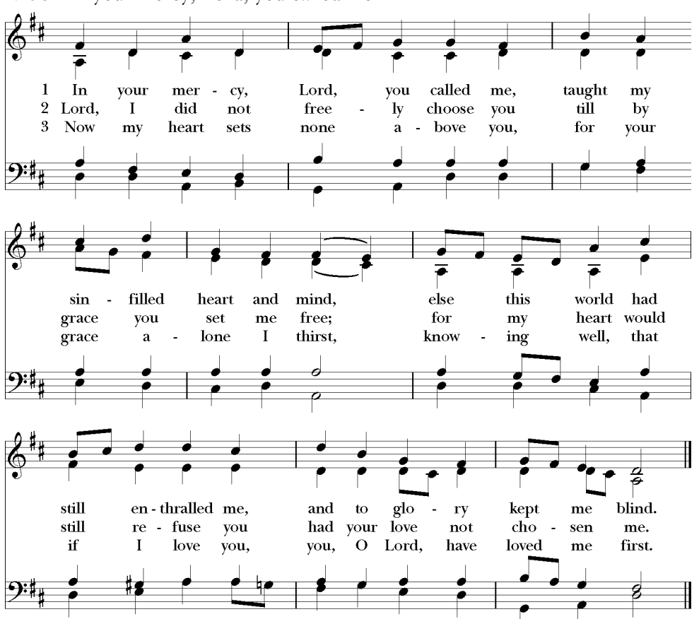
Hymn 706 'In your mercy, Lord, you called me'