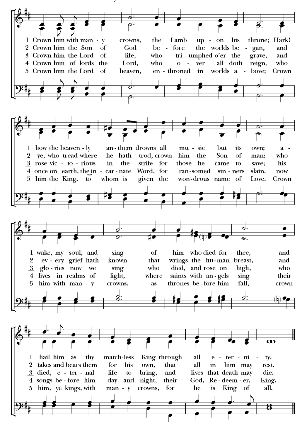
Hymn 494 'Crown him with many crowns'