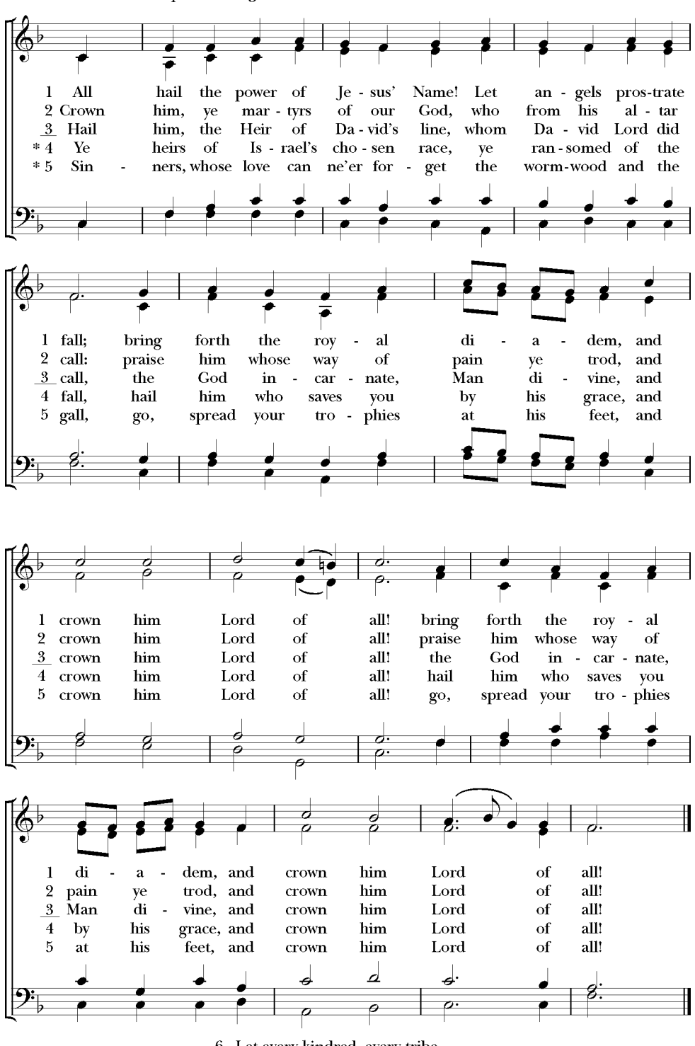
Hymn 450 'All hail the power of Jesus' Name!'

6 Let every kindred, every tribe, on this terrestrial ball, to him all majesty ascribe, and crown him Lord of all!