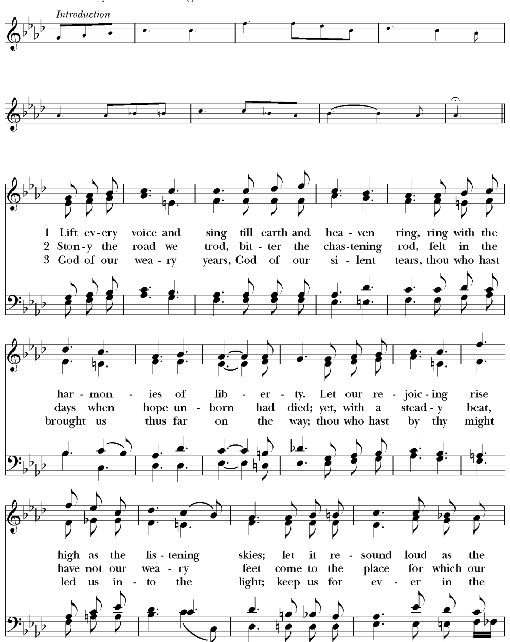
Hymn 599 'Lift every voice and sing'