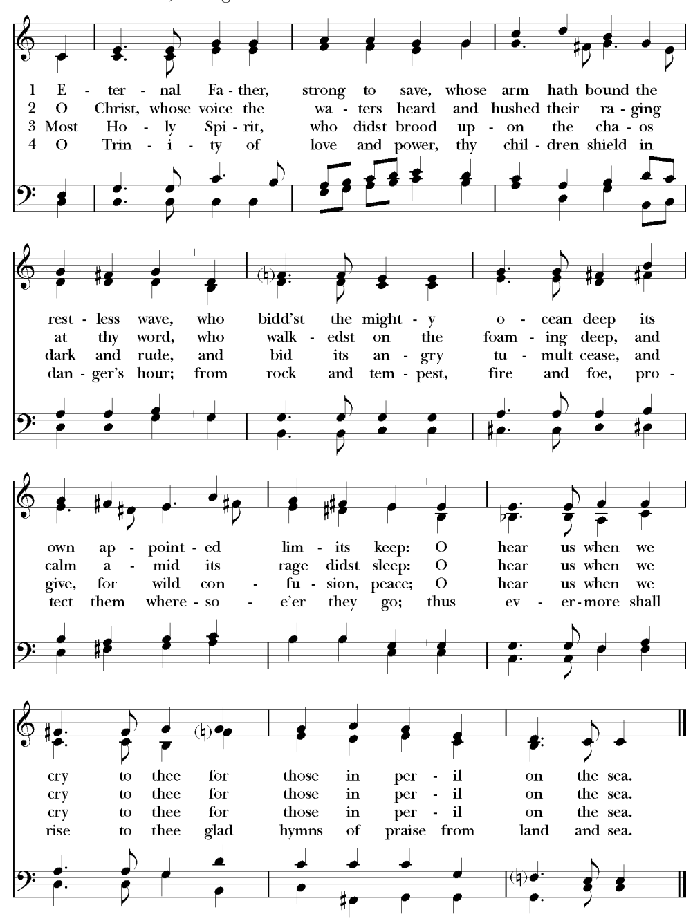
Hymn 608 'Eternal Father, strong to save'

Opening Acclamation & Collect for Purity