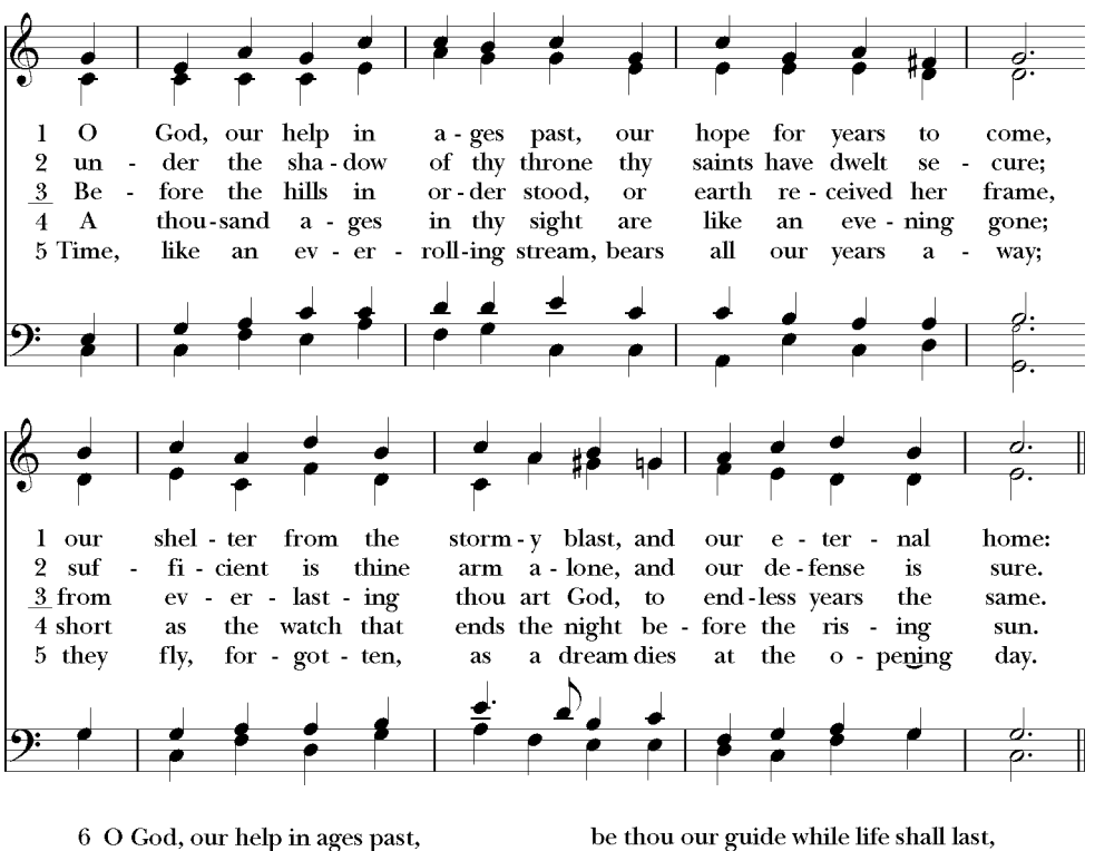
Hymn 680 'O God, our help in ages in past'