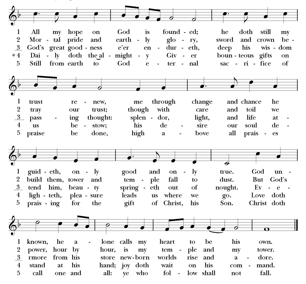
Hymn 665 'All my hope on God is founded'