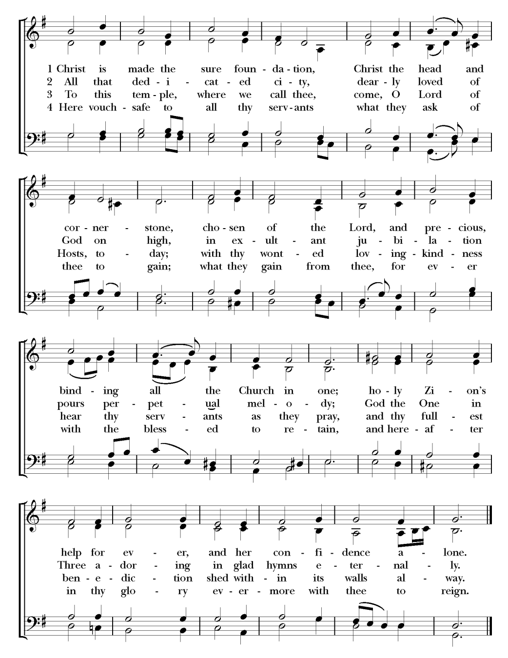
Hymn 518 'Christ is made the sure foundation'

Opening Acclamation & Collect for Purity