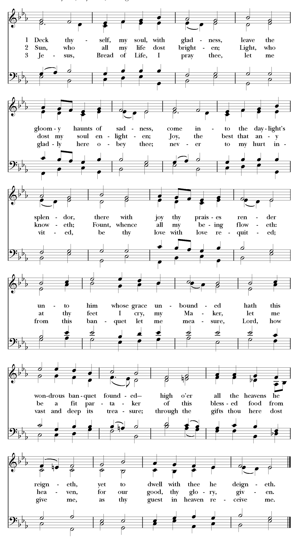
Hymn 339 'Deck thyself, my soul, with gladness'