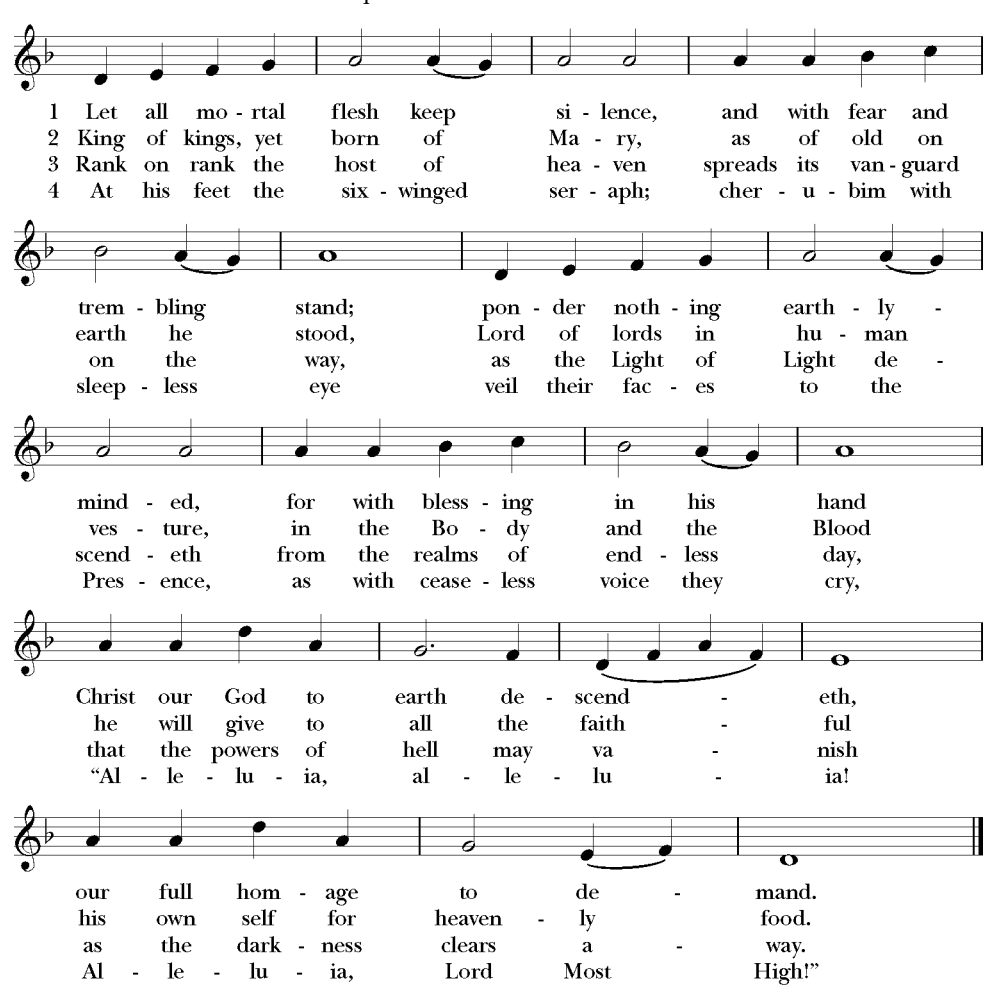
Hymn 324 'Let all mortal flesh keep silence'