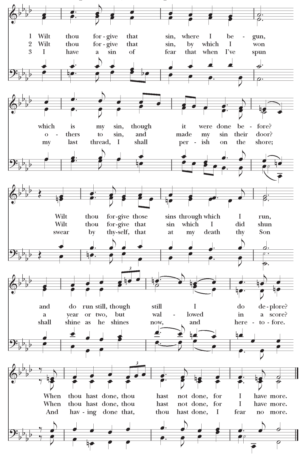
Hymn 141 'Wilt thou forgive that sin, where I begun'

A slight bow with hands crossed over the chest or joined in a prayerful gesture are healthy, loving ways for one to pass the Peace in these times.