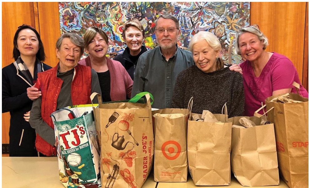
The Boston Warm Sandwich Team (with about 16 regular attendees) meets on Fridays to make brown bag lunches for the Ecclesia Ministries day program at Emmanuel Church on Newbury Street. The Sandwich Team returned to weekly lunch-making in May 2022. Each lunch consists of a sandwich, a piece of fruit (usually a clementine), and a cookie.

2021 was eventful: Investments returned 9.4% adding $3.5 million. There were five bequests totaling nearly $3 million, along with a very generous gift of $1.9 million from a condominium sale. $2,076,000 was provided for our operating budget, a 5.1% draw. Over $2 million was used to retire the debt of How Firm a Foundation capital campaign, and the 2006 mortgage for the former Rectory conversion to parish office. We ended the year with just over $41 million in assets, a record high.